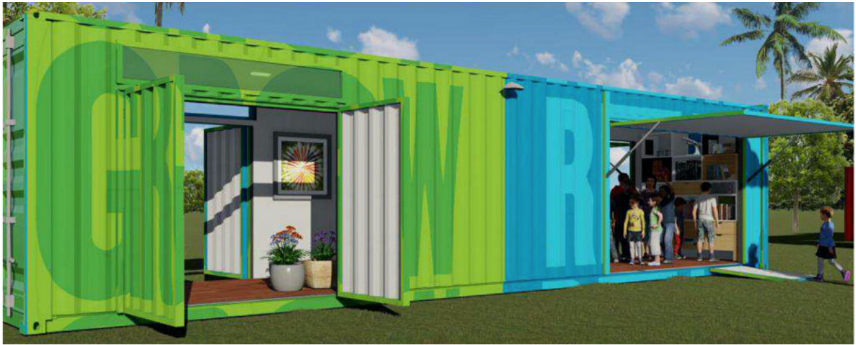
exhibit. This hands-on, transformative art experience brings interactive instructor-led and self-guided activities on the themes of Make, Play, Read, and Grow through two converted cargo shipping containers. SPACEcraft will set up the Read and Grow container in the library's parking lot, and have its Grand Opening on Saturday, November 14th . We're very excited to be the first public library in Pinellas County to offer this interactive exhibit.